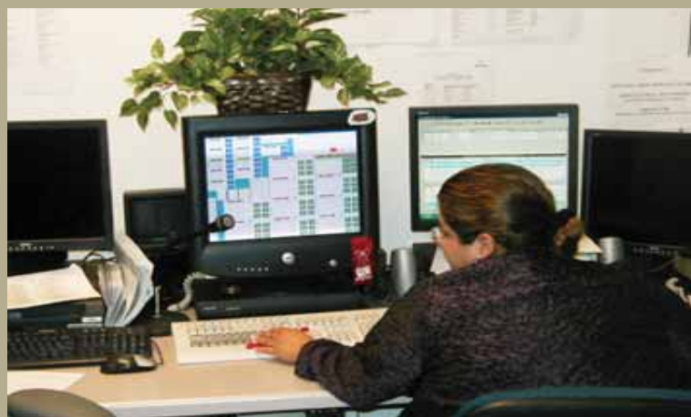
Capitol Metro (Austin, TX) dispatcher managing an ADA demand response system