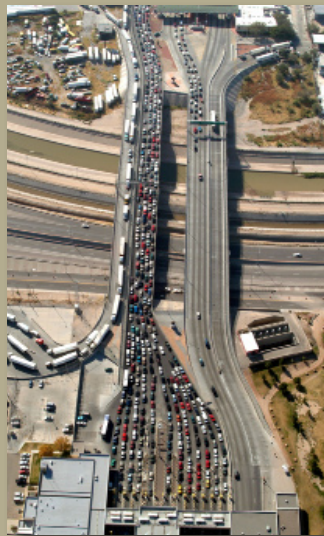
This view of the Bridge of the Americas in El Paso shows typically long queues of passenger and commercial vehicles entering the U.S. from Mexico.

"Single window" on the prototype system gives pre-trip information at the border as well as in the surrounding transportation network.